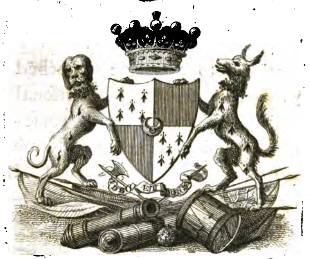
TO THE RIGHT HONORABLE THE