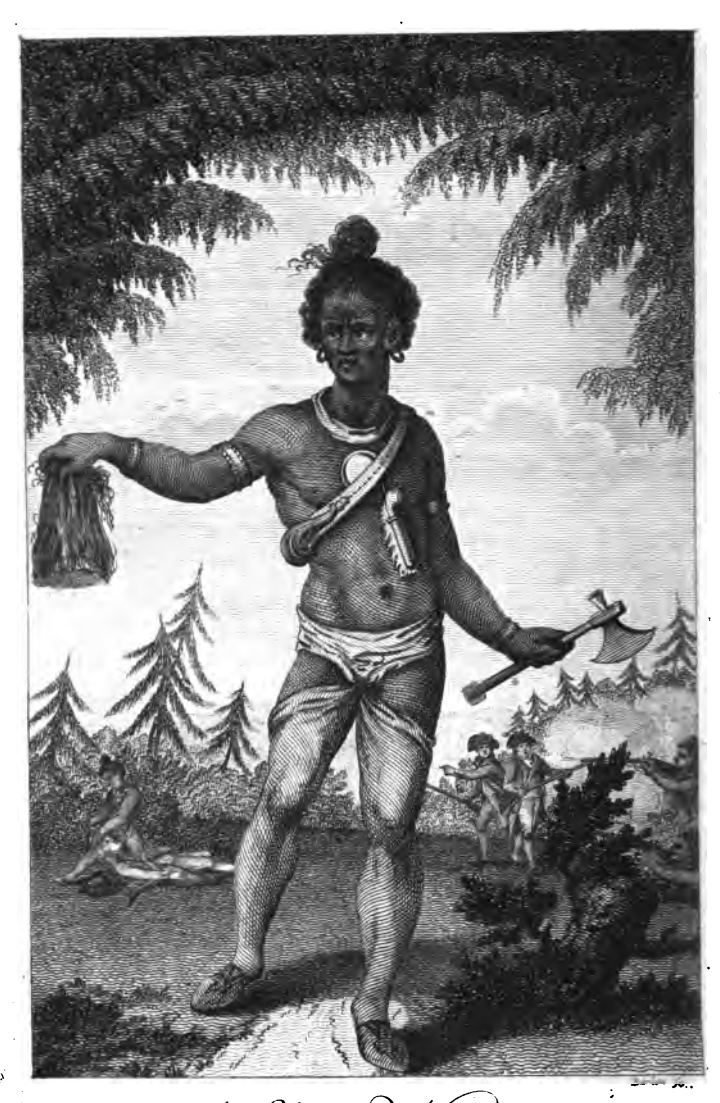
• An Indian Warrior Entering his Migwam with a Scalp.